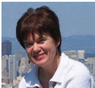
(Photo is taken in San Francisco, Twin Peaks Overlook)