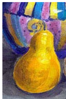
Painting fragment by Natalia Udaltsova

This annual event has been set for Saturday, September 24 . LAA participating artists ($25 membership level) are eligible to pay a special non-profit fee of $40. You will also be covered by our liability insurance policy; we will submit the required certificate of insurance for you. The 2011 registration form is included with this newsletter.