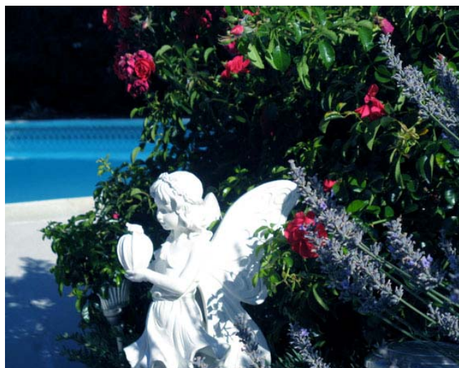
"My Little Fairy" by Natalia Udaltsova, digital photograph