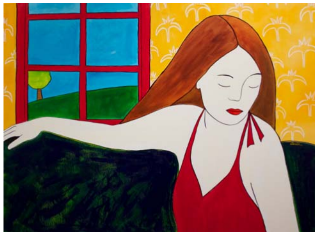
"Tessa" by Carla Gelbaum, acrylic on canvas

We're cleaning house and invite you to shop our back room for specially discounted works of art. Our artists have chosen work to discount 20, 25, 30 percent or more. With over 100 pieces in our backroom, you are sure to find