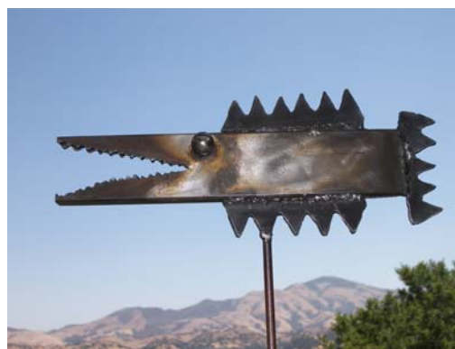
"Barracuda" by Joe Bologna, metal sculpture

Sculpture in this year's collection ranges in price from $60 to $600. Bologna says: "We are excited to bring moderately priced, one-of-a-kind pieces that will provide visual delight to your home and garden."