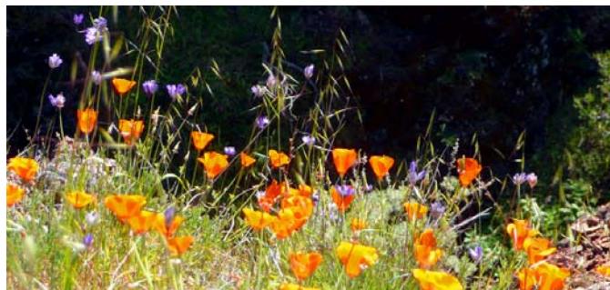
"April Palette" by Natalia Udaltsova, photograph