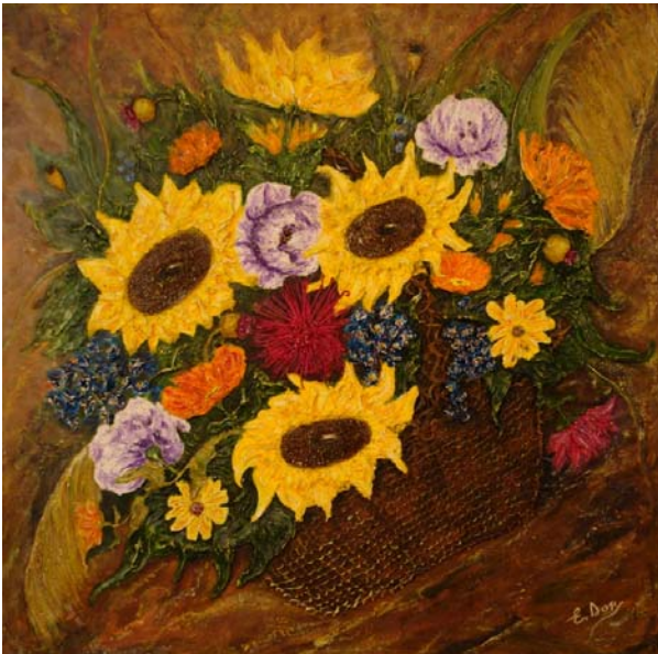
"Colors of Play" by Elena Doronkina, mixed media

The works in this exhibit are based on the attraction of light within the dark: the glow of the storefronts along Taeuffer's hometown main street, the shimmering chandeliers in a festive restaurant or simply a corner with a welcoming chair and reading light.